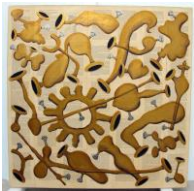
TIM ROLLINS AND K.O.S. Study for Amerika - A Refuge , 1992 paint on book pages adhered to linen 36 x 36 x 1 1/2 inches TRKOS92.001