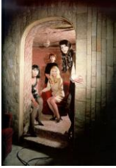
YASUMASA MORIMURA Self-portrait (Actress)/After Catherine Deneuve 4 , 1996 ilfochrome print mounted on acrylic 78 3/4 x 63 inches Edition of 3 YM96.003