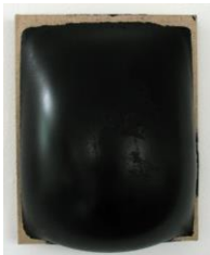
BYRON KIM Belly Painting (Dioxazine Violet) , 1992 Encaustic on linen on panel 10 x 8 inches BKI08.002