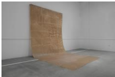
EMILY NELMS PEREZ Legitimation , 2018 silicon 104 x 101 x 104 inches ENP18.001