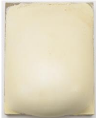
BYRON KIM Belly Painting , 1992 Encaustic on linen on panel 10 x 8 inches BKI08.001