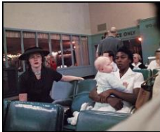
GORDON PARKS Airline Terminal, Atlanta, Georgia 1956 archival pigment print 11 x 14 inches (print) 16 5/8 x 18 3/16 inches (framed) Edition AP 3 GP56.009.AP3/3