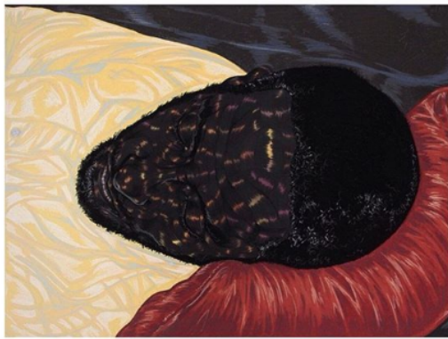
Detail, Diptych (left): He just was, 2014. Charcoal, pastel, marker and graphite on paper // IG