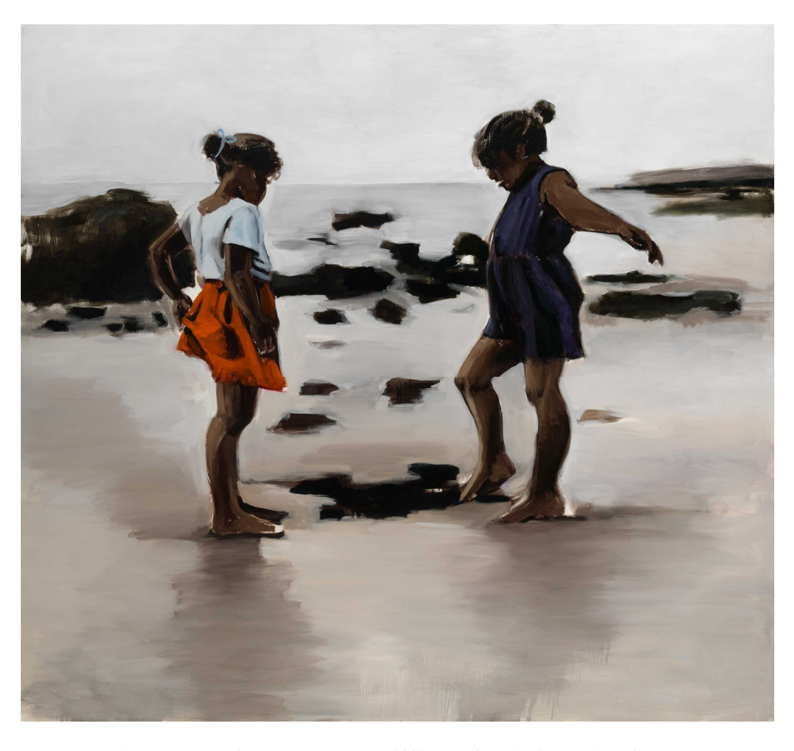
Lynette Yiadom-Boakye - Condor and the Mole 2011 Arts Council Collection, Southbank Centre, London