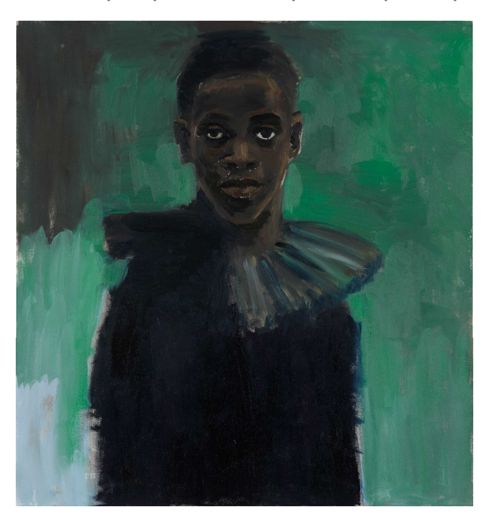
Lynette Yiadom-Boakye - A Passion Like No Other 2012 Collection Lonti Ebers