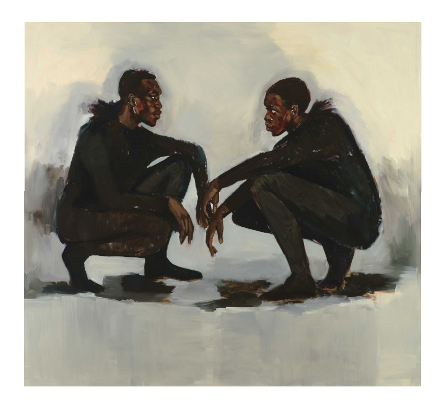
Lynette Yiadom-Boakye - No Need of Speech 2018 Carnie Museum of Art, Pittsburgh