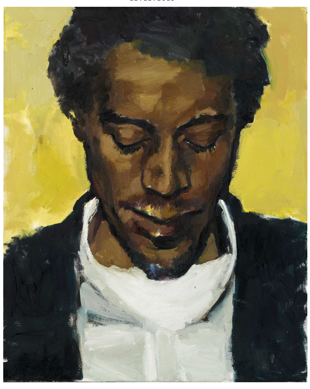
Lynette Yiadom-Boakye - Citrine by the Ounce 2014 Private Collection