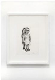
Third Person, 2022 charcoal on paper 11 5/8 x 8 5/8 inches (sheet) 19 3/4 x 16 3/4 x 1 1/2 inches (framed) signed and dated on the front Inventory #CS22.012