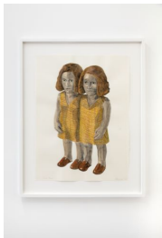
First Person, 2022 acrylic ink wash on paper 30 x 22 inches (sheet) 38 1/8 x 30 1/8 x 1 1/2 inches (framed) signed and dated on the front Inventory #CS22.018