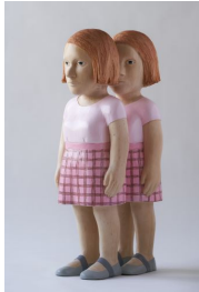
Public Opinion , 2021 Jelutong wood, enamel and oil paint 27 3/4 x 9 3/4 x 13 1/2 inches signed and dated at the bottom Inventory #CS21.007