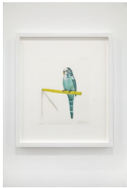
Budgie, 2022 acrylic ink wash on paper 11 5/8 x 8 5/8 inches (sheet) 19 3/4 x 16 3/4 x 1 1/2 inches (framed) signed and dated on the front Inventory #CS22.005