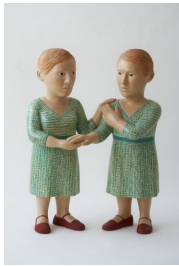
Accomplice, 2021 Jelutong wood, enamel and oil paint 27 3/4 x 20 x 11 inches signed and dated at the bottom Inventory #CS21.006