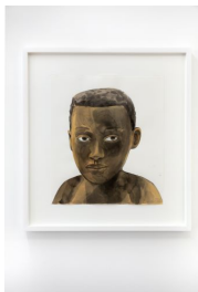
New Favourite, 2022 acrylic ink wash on paper 16 5/8 x 17 3/8 inches (sheet) 27 3/4 x 25 x 1 1/2 inches (framed) signed and dated on the front Inventory #CS22.015