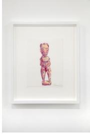
Baule 16, 2022 color pencil on paper 11 5/8 x 8 5/8 inches (sheet) 19 3/4 x 16 3/4 x 1 1/2 inches (framed) signed and dated on the front Inventory #CS22.003