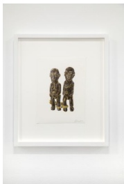
Present van Jack, 2022 color pencil on paper 11 5/8 x 8 5/8 inches (sheet) 19 3/4 x 16 3/4 x 1 1/2 inches (framed) signed and dated on the front Inventory #CS22.009