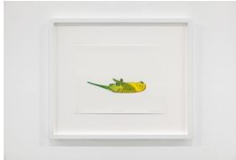
The End, 2021 silkscreen 11 1/2 x 15 inches (sheet) 19 1/2 x 23 1/8 x 1 1/2 inches (framed) AP3, Edition of 35, with 3APs Inventory #CS22.017.AP3