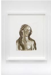
Magdalene, Erhart, 2022 acrylic ink and color pencil on paper 11 5/8 x 8 5/8 inches (sheet) 19 3/4 x 16 3/4 x 1 1/2 inches (framed) signed and dated on the front Inventory #CS22.008