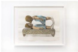
Intruder , 2022 acrylic ink wash on paper 22 x 29 7/8 inches (sheet) 30 1/8 x 38 1/8 x 1 1/2 inches (framed) signed and dated on the front Inventory #CS22.002