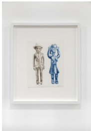
Colon, 2022 color pencil on paper 11 5/8 x 8 5/8 inches (sheet) 19 3/4 x 16 3/4 x 1 1/2 inches (framed) signed and dated on the front Inventory #CS22.006