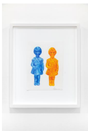
Twins, 2022 acrylic ink and color pencil on paper 11 5/8 x 8 5/8 inches (sheet) 19 3/4 x 16 3/4 x 1 1/2 inches (framed) signed and dated on the front Inventory #CS22.013