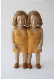
First Person, 2021 Jelutong wood, enamel and oil paint 27 3/4 x 15 x 9 inches signed and dated at the bottom Inventory #CS21.004