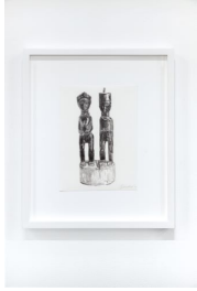
Baule 27, 2022 graphite on paper 11 5/8 x 8 5/8 inches (sheet) 19 3/4 x 16 3/4 x 1 1/2 inches (framed) signed and dated on the front Inventory #CS22.004