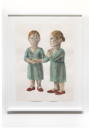
Accomplice, 2022 acrylic ink wash on paper 29 7/8 x 22 inches (sheet) 38 1/8 x 30 1/8 x 1 1/2 inches (framed) signed and dated on the front Inventory #CS22.001