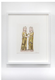
Visitation, 2022 color pencil on paper 11 5/8 x 8 5/8 inches (sheet) 19 3/4 x 16 3/4 x 1 1/2 inches (framed) signed and dated on the front Inventory #CS22.014