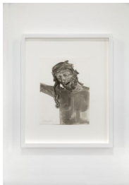
Riemenschneider, 2022 acrylic ink wash on paper 11 5/8 x 8 5/8 inches (sheet) 19 3/4 x 16 3/4 x 1 1/2 inches (framed) signed and dated on the front Inventory #CS22.010