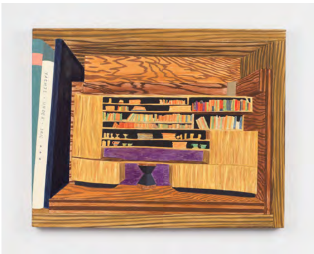
Becky Suss, "Maquette 2 (Wharton Esherick)" (2018) Oil on canvas, (72 x 84 inches) (Image courtesy the artist and Fleisher/Ollman, Philadelphia Photo: Claire Iltis)