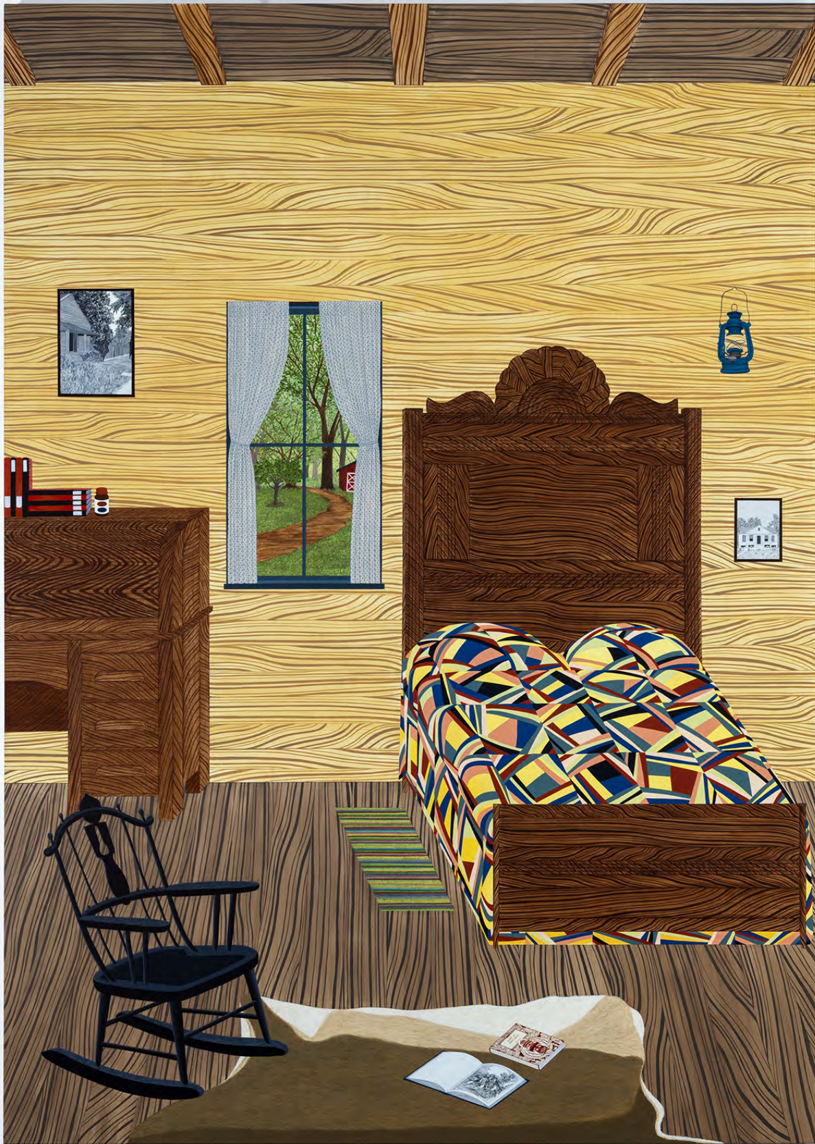
Logan Family Home (1933), 2020