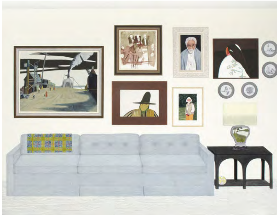
Becky Suss, Living Room (six paintings, four plates), 2015, oil on canvas, 84 x 108 inches. Courtesy the artist and Fleisher/Ollman, Philadelphia.