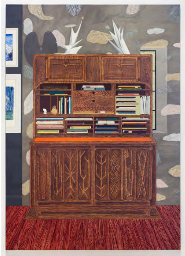
Becky Suss, "Drop Leaf Desk (Wharton Esherick)" (2018), oil on canvas, 72 x 84 inches