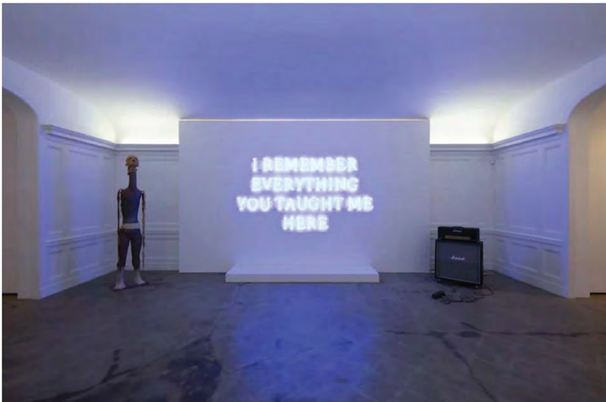
Installation view of "Feedback" at The School