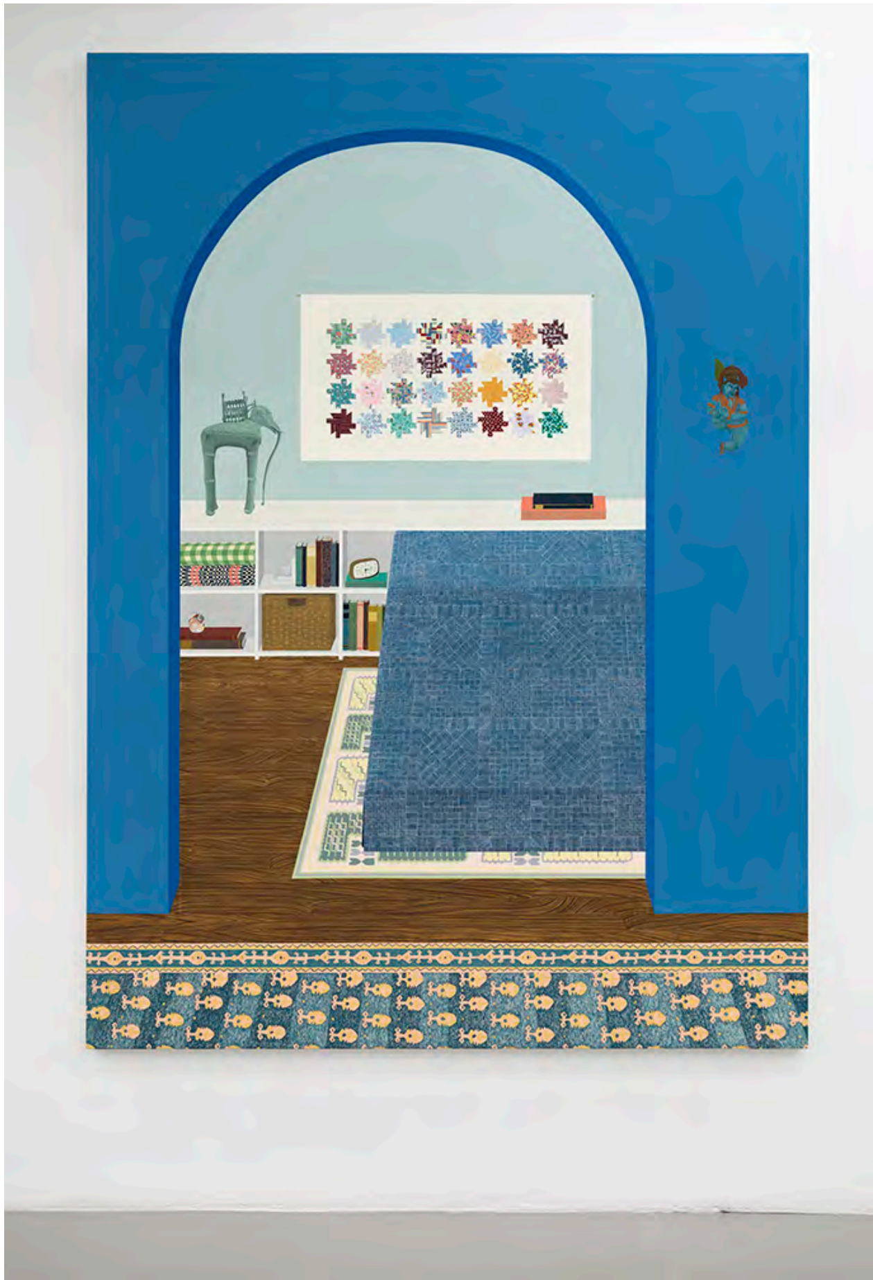
Becky Suss, "Blue Apartment" (2016)