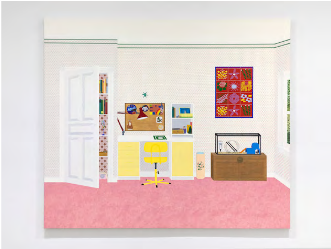
Becky Suss, "8 Greenwood Place" (1988-93), 2021 oil on canvas, 72 x 84 x 2 1/2 inches.

precision, and conjure within each painting curious, enchanting asymmetricalities. As products of meticulous research, memory, editing, and imagination, they are as much poems as they are paintings. If Baldwin's book crystallized the notion of a "child's story for adults," then we might think of Suss's work as a brand of children's vision for adults.