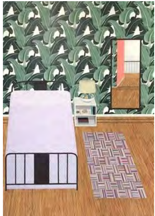
Becky Suss, Bedroom (Rubáiyát of Omar Khayyám) , 2015, oil on canvas, 84 x 60".

Two small, square paintings of the artist’s garden in Philadelphia, Kensington, Winter , 2010, and Kensington, Summer , 2010–11, together interrupt the show’s hypnotic sense of frozen time. The skeletons of trees in snow followed by bursts of wiry green have greater perspectival depth and an emotional immediacy absent from the domestic canvases. Their concise portrayal of the vitality of change contrasts with the exhibition’s overwhelming melancholia.