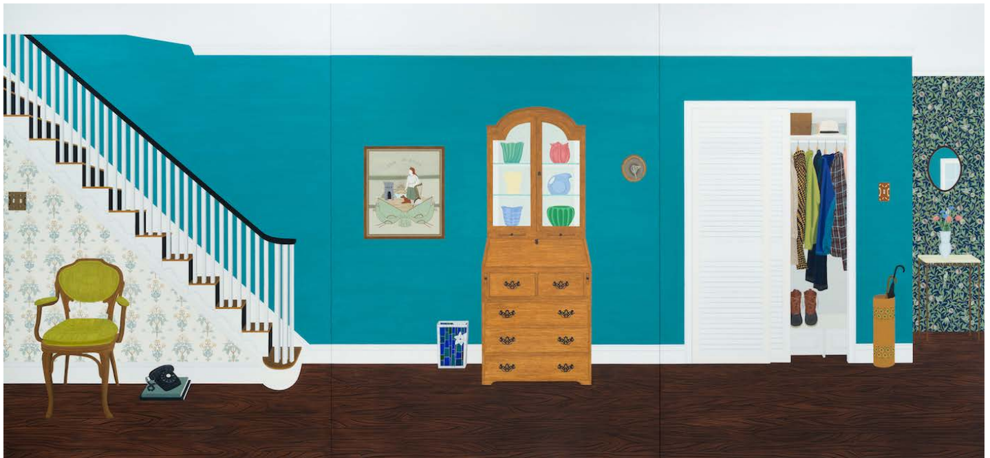
Becky Suss, "Hallway" (2017)

These diverse sources aren't made explicit, but Suss's paintings immediately feel unreal because of their flatness, broad perspectives, and use of three-fourths scale — which makes these rooms seem enterable from afar, but up close, are clearly diminutive, and even dollhouse-like because of Suss's playful colors. But her careful and deliberate construction of them also lends them their sincerity and heartfelt associations of a relatable home. Her paintings celebrate the everyday environments that we may take for granted, and urge us to behold the wonder in our domestic spaces, which are stages for us to air our identity without bars. Our gaze is kept moving by the many curious objects and busy patterns, which encourage a meandering of another kind — to mine our own memories for places that hold meaning. Further inducing this psychological wandering are Suss's many connective furnishings, like doors, archways, mirrors, and windows that create continuous realms, like abstract, labyrinthine spaces of the mind.