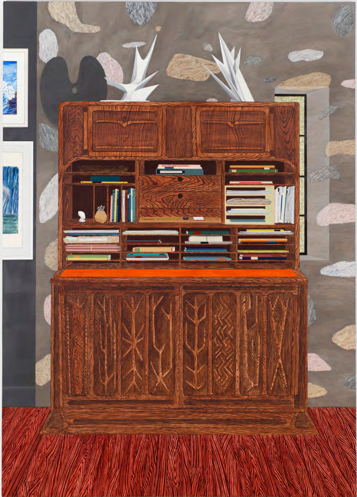
Drop Leaf Desk (Wharton Esherick), 2019