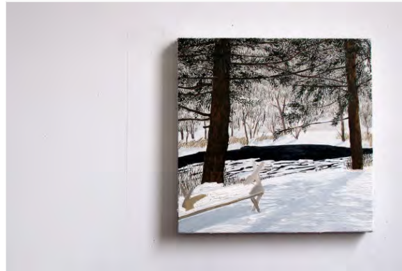
“Green River” - Oil on canvas - 16” x 16”