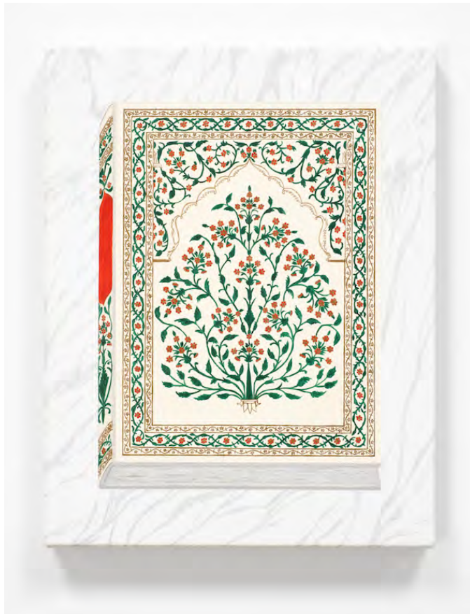
Becky Suss, "The Rubáiyát of Omar Khayyám" (2015), oil on canvas, 14 x 11 inches (courtesy the artist and Fleisher/Ollman, Philadelphia. Photo by Aaron Iglar)

This dense jumble of interior and exterior objects constitutes a canvas-wide window view that doesn't feel much like a view at all. Jungle-like, the statuary and the trees clog up all available lines of sight. A similar sense of visual plenitude, with minimal unoccupied space, pervades both "Bedroom" and "Bedroom (Rubáiyát of Omar Khayyám)," as well as the smaller "Kensington, Summer" (2010-11), which depicts a backyard garden with a meticulously rendered palimpsest of overgrown greenery. But even in the more aerated canvases, the paintings' many patterns, textures, and leafy sections still give the sense that something is being camouflaged, hidden, not shown. For example, the background wall in "Living Room (Yogi 2)" (2013), a mostly-white and therefore innocent-seeming room, stops just short of the canvas' left edge to reveal a peek of the non-white space beyond; like an ever so slightly drawn curtain, it teases with the prospect that as-yet undisclosed secrets might lay behind it.