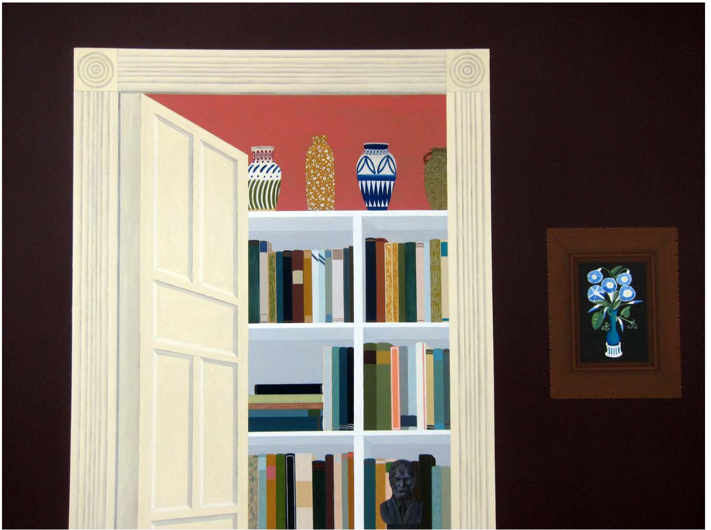
Becky Suss, detail of "August" (2016)