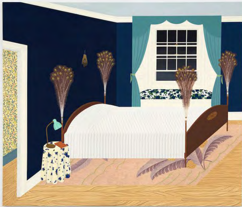
Becky Suss, "Bedroom with Peacock Feathers" (2017)