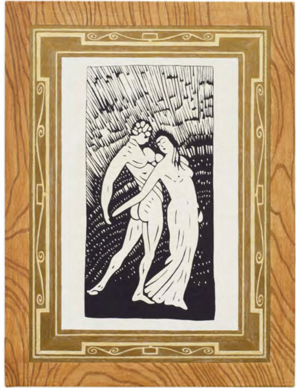
Becky Suss, "Theodore Dreiser, Of a Great City (Wharton Esherick)" (2018) Oil on canvas, (72 x 84 inches)

A shared appreciation for the dynamic qualities of wood grain flows seamlessly from 2D painting to 3D sculpture. Esherick's wooden objects are carved with a sensitivity to the grain's undulations, and Suss revels in its patterning where it appears in Esherick's home: bookcases, floors, walls, chairs, and ceilings vibrate with vivid veins of warm browns and yellows. A series of small paintings depict four woodcut prints by Esherick, hung in hand-carved wooden frames on an unpainted wooden wall. Rendered through Suss's flattened perspective, these surreal, trompe l'œil investigations of Esherick's influences — the Expressionist woodcuts, the Deco frames — demonstrate a deep collaboration between the artists.