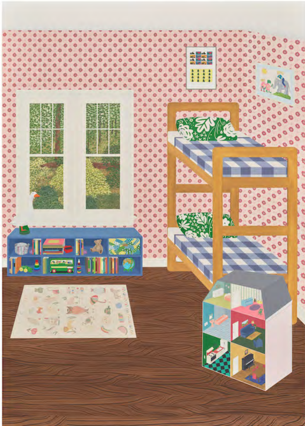
Becky Suss, "8 Greenwood Place (my bedroom)," 2020 oil on canvas, 84 x 60 x 2 1/2 inches (canvas).

It is no wonder, then, that Suss painted an illustrated excerpt from Little Man, Little Man . Her WT, TJ and Blinky (2020) depicts a single scene from Baldwin and Cazac's collaboration, where the three children process an injury to WT—a cut and bleeding foot, due to some recently shattered glass—before all retreat to their building's superintendent's basement apartment for