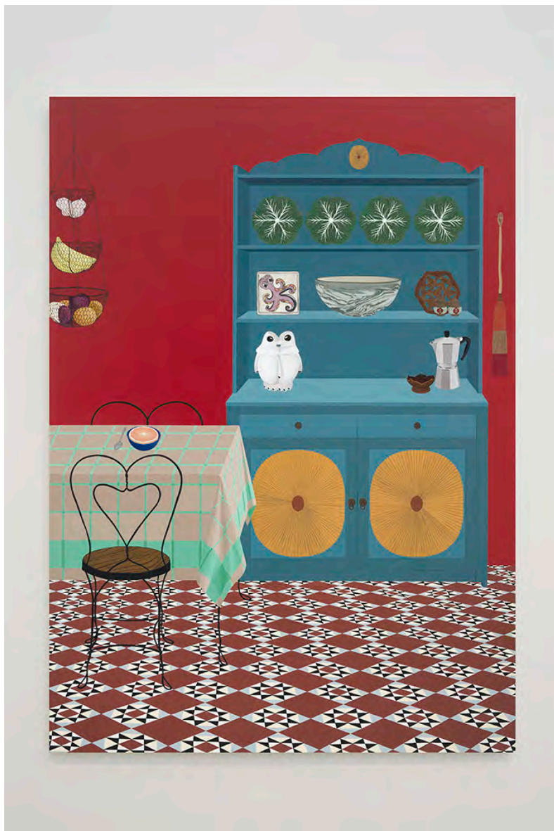
Becky Suss, "Red Apartment" (2016)

Seven of these large-scale works are currently on view at Jack Shainman gallery for Suss's solo show, Homemaker , where they boldly usher the quiet comforts of home into the sterile, white-walled space. Books, seashells, and other evocative trinkets such as a saxophone mouthpiece line shelves; a sliced grapefruit nestles in a bowl like a ritual breakfast for one; a closet door stands ajar to reveal soft flannel shirts and an unmarked box of potential secrets.