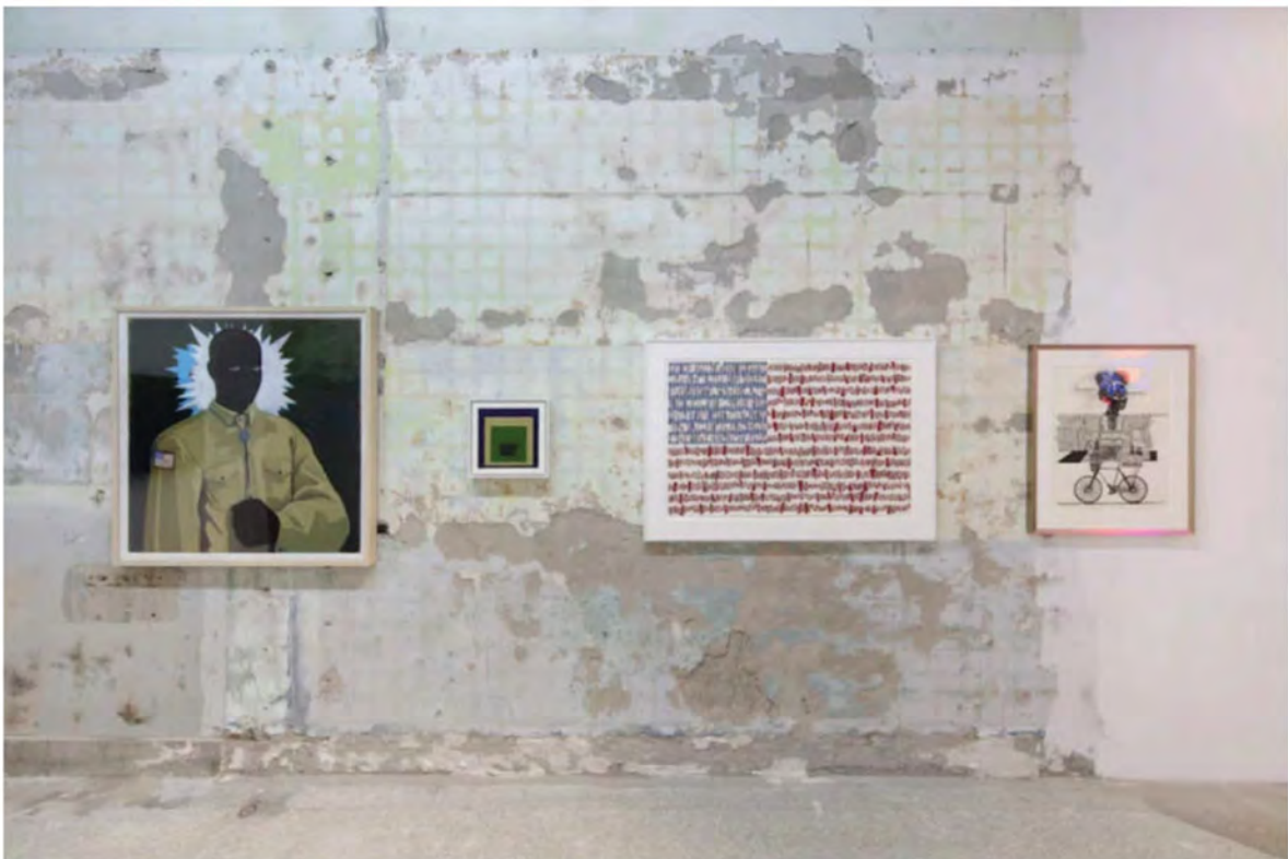
Installation view of "Feedback" at The School.

The rooms depicted in my work carry so much weight and I want them to allow the person who is viewing them to feel like they are occupying the depicted space. The School has these little tiny moments that collapse the space between the time of when it was a school and when we're in it now. You have a moment where it's both times at once.