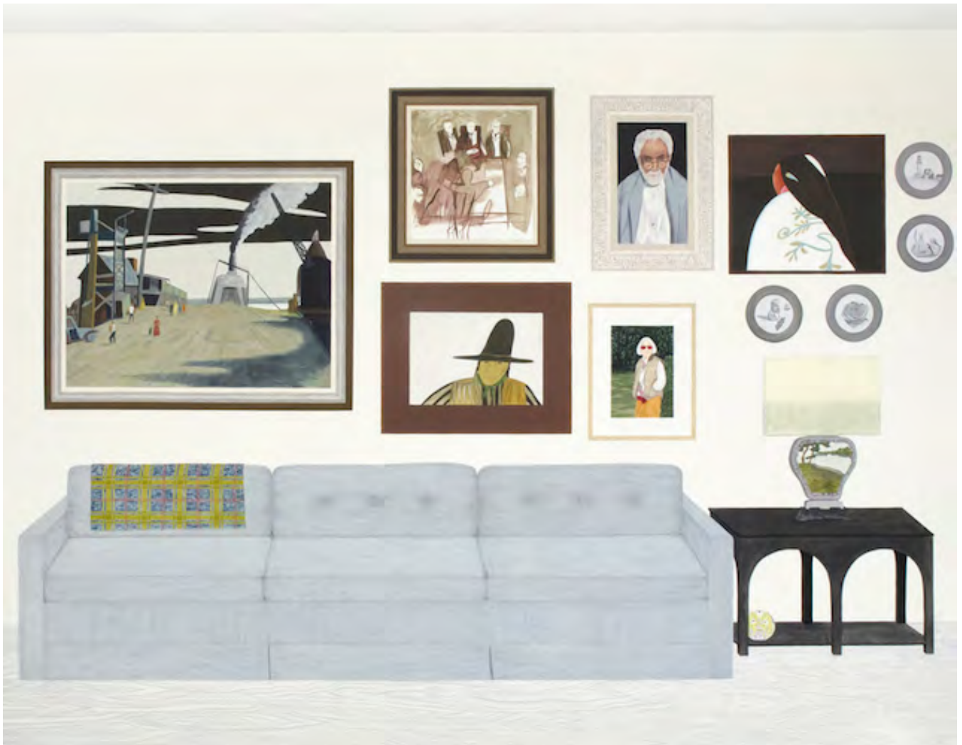
Becky Suss, “Living Room (six paintings, four plates)” (2015), oil on canvas, 84 x 108 inches

Suss’s imaginative reconstructions, X-rays onto exoticism in its many domestic guises, ultimately suggest that her family’s mid- to late-20th-century suburban milieu lacked an indigenous visual culture. Or, more precise, it possessed one — aspirational and sentimental bric-a-brac — but it was founded upon cultural appropriation and a class-based fear of bad taste.