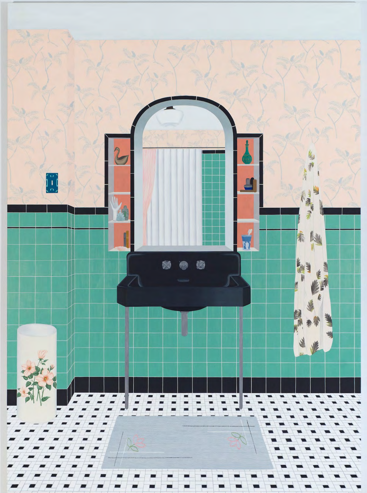
Bathroom (Ming Green), 2016