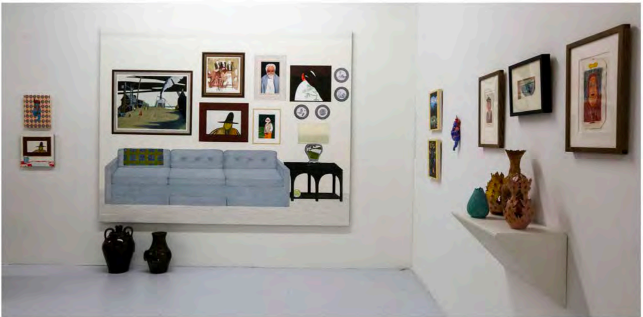
The exhibition space for the Fleisher/Ollman gallery of Philadelphia, a first-time exhibitor at the Independent art fair.

There are overlaps between 45 galleries exhibiting here and the other, larger fairs; there are also a number of fairs considerably more indie in scope and ambition, including Spring/Break , at Skylight at Moynihan Station. But the Independent has moved from Chelsea to downtown; the light pouring through the windows and open plan of the fair, along with work ranging from the self-taught to the ephemeral, make the fair a welcome respite from the windowless casino-warren in other exhibition spaces.