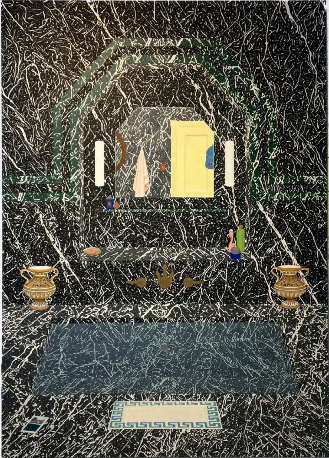
To Be Titled, 2019