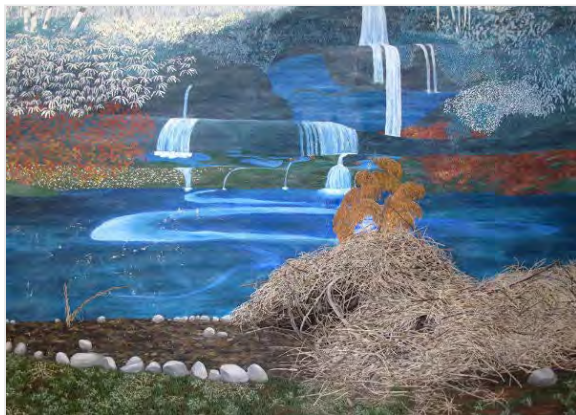
"Emerald Street" - Oil on canvas - 16" x 16"

photo of them or simply recalling the image in the mind. The viewer's emotional response to the landscapes attests to the honesty of its memory activation, which for the modern viewer relies not only on personal and collective narratives but also competing images—historical, photographic, remembered, and imagined.