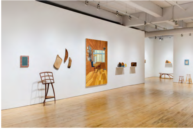
Becky Suss /Wharton Esherick at Fleisher/Ollman Gallery. (Installation view)