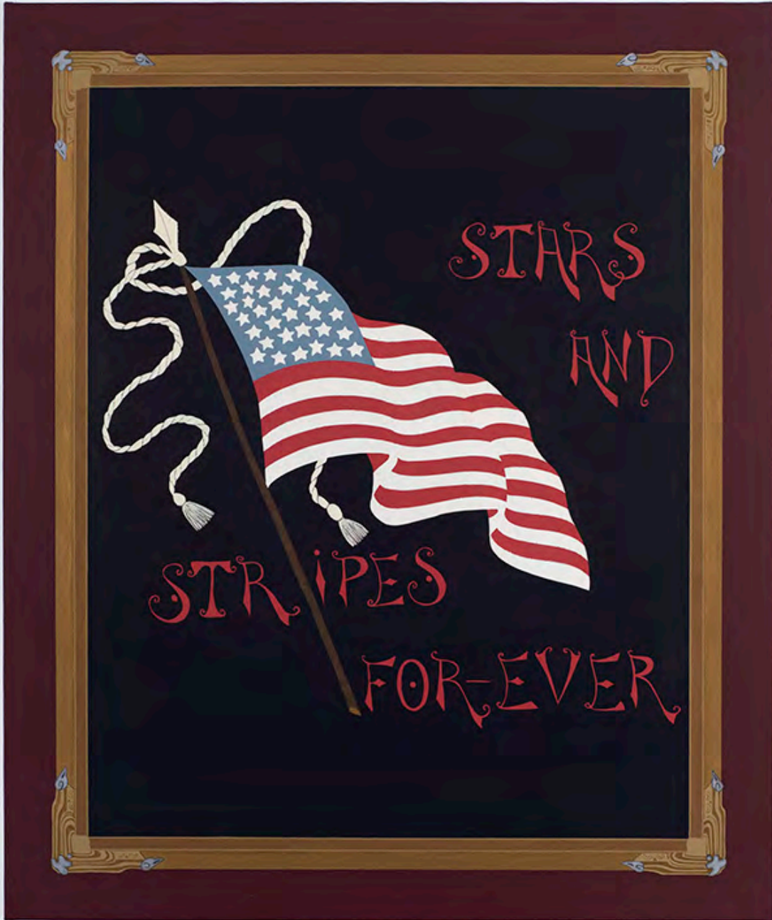
Becky Suss, "Stars and Stripes For-Ever" (2016)